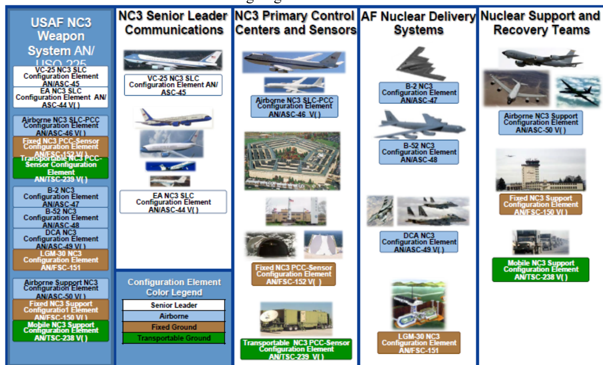
Figure 1: Representative types of systems in USAF NC3 10

more weapons with all related equipment, materials, services, personnel, and means of delivery and deployment required for self-sufficiency.” 9 The Air Force recognized that such a designation was not a perfect fit for a large, complex system of systems like NC3, but it was the best they could come up with to highlight NC3’s importance and address the multitude of issues and myriad lines of effort necessary to ensure it meets the rigid specifications enumerated above. Depending on who you ask and how they count, the US NC3 system consists of as many as 160 different systems: satellites, aircraft, command posts, communication networks, land stations, radio receivers, and so on—a system of systems perhaps too complex for any one person to totally understand. The Air Force NC3 Center alone is responsible for 62 distinct subsystems (many of which are shown in figure 1.) STRATCOM wants a simpler and more flexible system for future leaders to come out of the ongoing modernization effort.