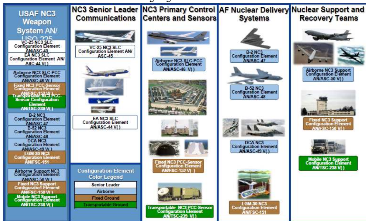
Figure 1: Representative types of systems in USAF NC3 10

more weapons with all related equipment, materials, services, personnel, and means of delivery and deployment required for self-sufficiency.” 9 The Air Force recognized that such a designation was not a perfect fit for a large, complex system of systems like NC3, but it was the best they could come up with to highlight NC3’s importance and address the multitude of issues and myriad lines of effort necessary to ensure it meets the rigid specifications enumerated above. Depending on who you ask and how they count, the US NC3 system consists of as many as 160 different systems: satellites, aircraft, command posts, communication networks, land stations, radio receivers, and so on—a system of systems perhaps too complex for any one person to totally understand. The Air Force NC3 Center alone is responsible for 62 distinct subsystems (many of which are shown in figure 1.) STRATCOM wants a simpler and more flexible system for future leaders to come out of the ongoing modernization effort.